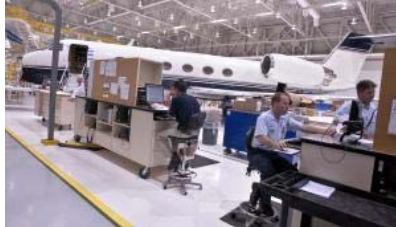
Gulfstream Aerospace's new Savannah Service Center is part of a seven-year, $400 million long-range expansion plan that will add more than 1,100 new jobs in the Savannah area.